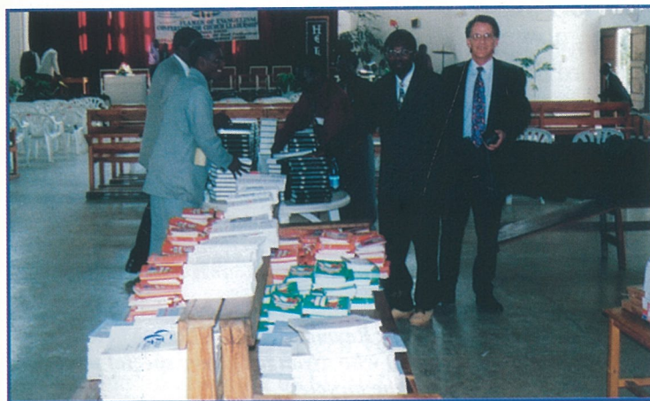
Left: Word on Wheels has provided seven hundred and fifty kilogram of gospel literature to the outreach in Zambia. I.e: Three hundred Heart of Man charts, three thousand Heart booklets, ten thousand tracts and one hundred discipleship courses.