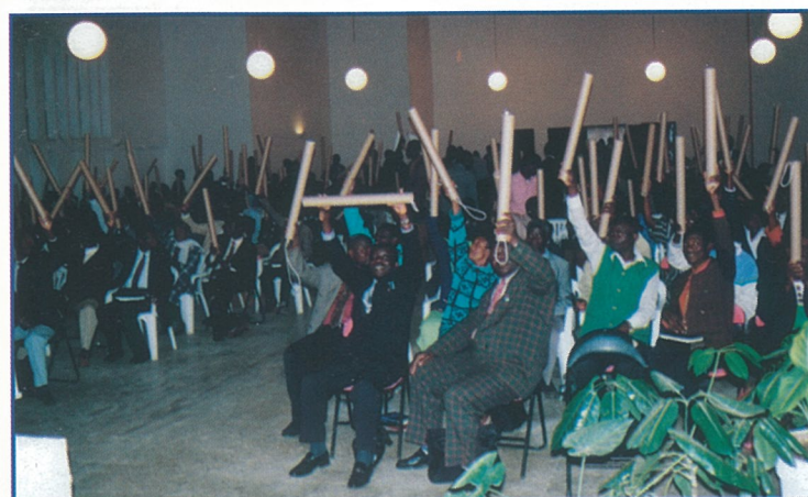
Left: These leaders are exuberant as they are now ready and willing to reach out and win the lost to Jesus Christ by using the means they have been provided with. Their joy can clearly be seen.